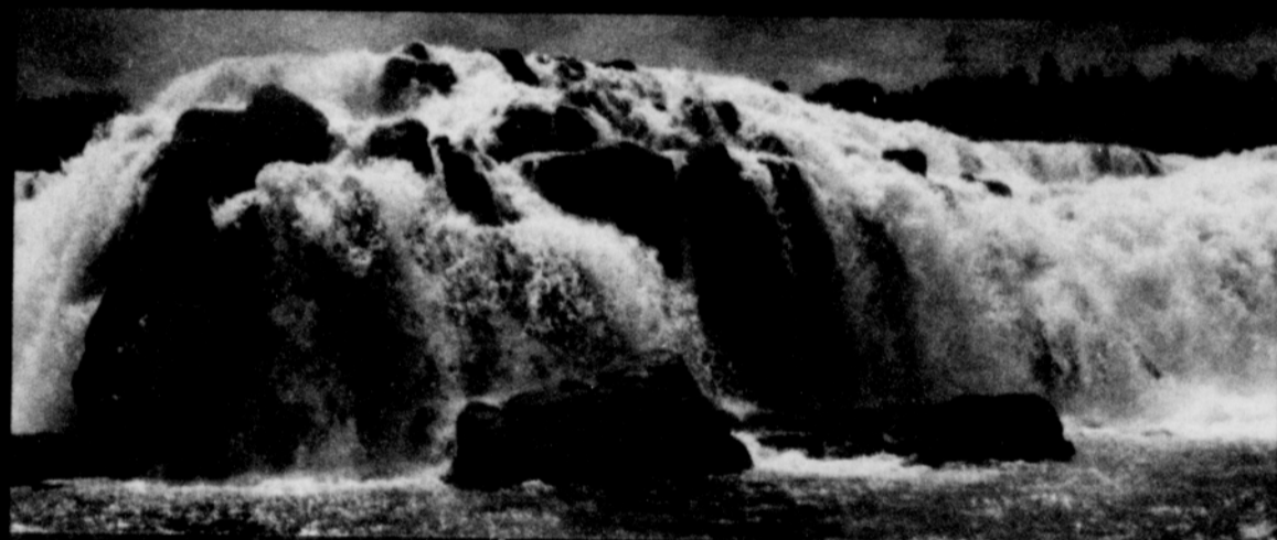
Willamette Falls is one of the few places with harvestable eel populations and where we can gather during the daytime.