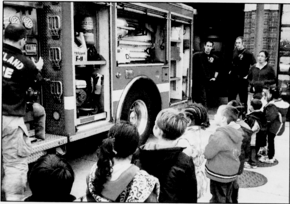
Students at the Siletz Tribal Head Start in Portland visit a local fire station for a firsthand look at the equipment firefighters use to fight fires and save lives.