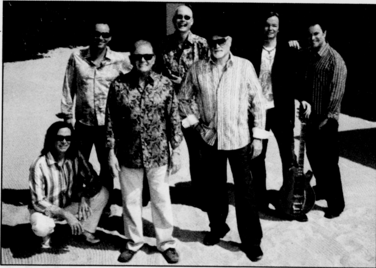
The Beach Boys