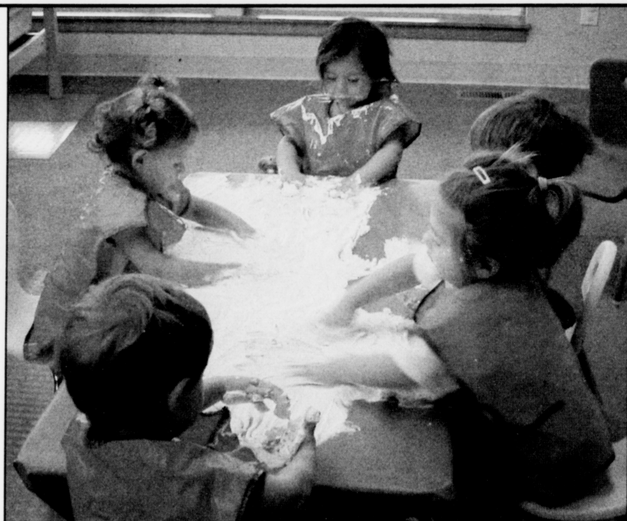
The Toddler Class at the Tenas Illahee Child Care Center use whip cream to paint the table. Painting with whip cream is a good sensory activity, kids can squish it between their fingers and from the looks of it they're having fun eating it too!