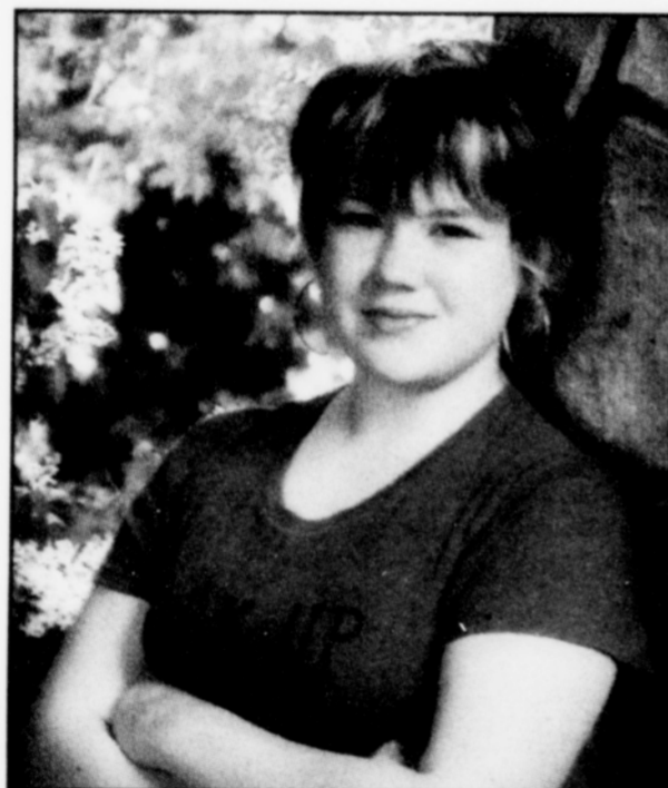
To Sequoia Aspen Breck – Wow-Wee! Check out my BFF, what a QT, all grown up now and still just as special as the day she was born! OMG starting HS in the fall too! This is 2muh! Time is flyin ... B4 U know 2DAY is gone ... 2MORO too, whts the D8 now? LOL ... PCM! Grami :-D