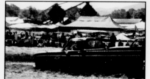
Mud racing world – so there we were ... necks stretched to capacity, heads turned to the left, a silence over the crowd, then bam! Racin' for the fun of it every night in the front row (OK, close to the front)! Heat beating down on us like the Mohave desert (OK, we were in the shade). Our one and only "babe!" "I got you, babe" ... in a photo, that is! Mud was flying (trucks too), wheels spinnin, engines screamin (and babies too) – truly an action-packed day! She was having the time of her life and huge beautiful smile! She must have been goin hundreds of MPH (seemed like it to us)!