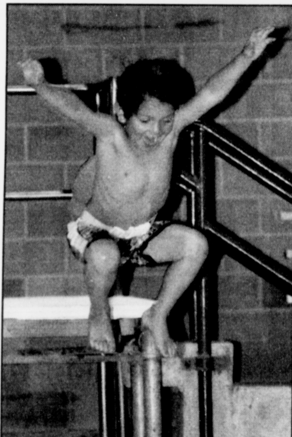
Head Start students in Siletz enjoy two weeks of swimming lessons, followed by a year-end barbeque at a park in Toledo. The Head Start Parent Committee received funding for this from the Siletz Tribal Charitable Contribution Fund.

For an application, please contact the Cultural Program at 541-444-8246 or 800-922-1399, ext. 1246.