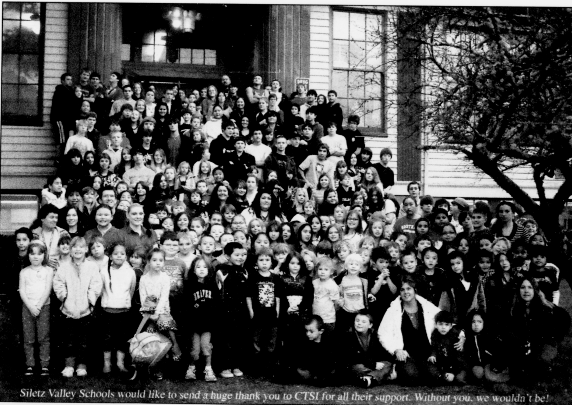
Siletz Valley Schools would like to send a huge thank you to CTSI for all their support. Without you, we wouldn't be!