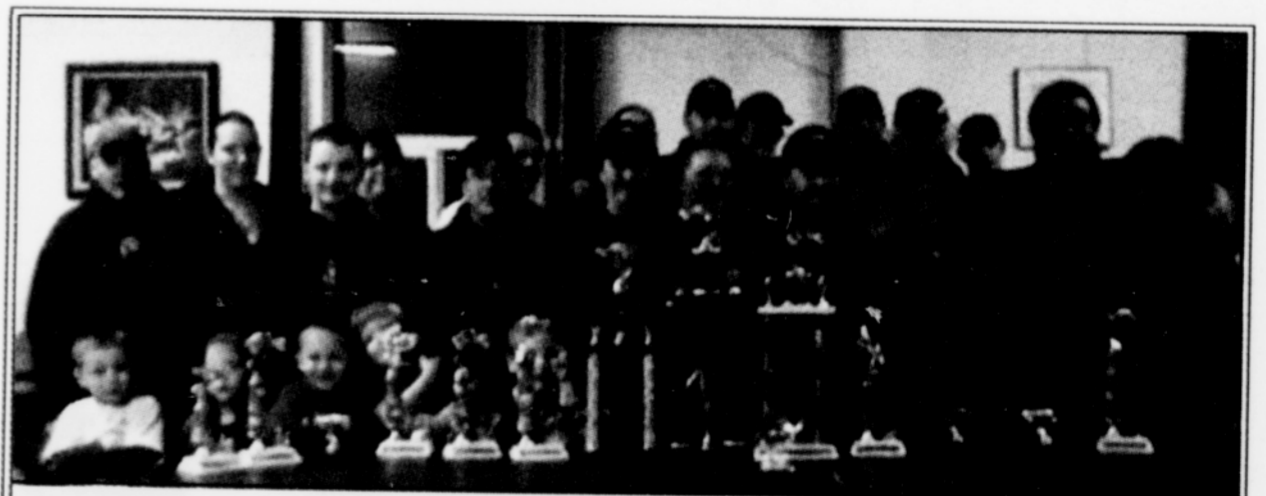
Scream' Eagle Racing Team