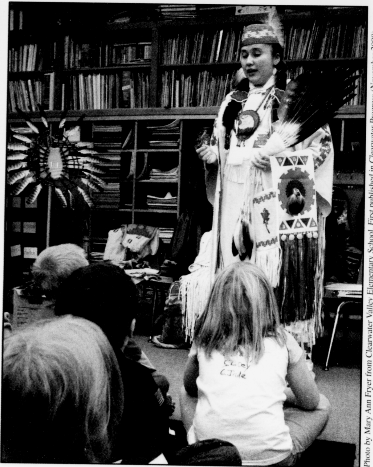
First published in Clearwater Progress (November 2008)

In the presentations, I was able to show the regalia worn and related stories. I used the Siletz website to share pictures of family and Tribal member photos.