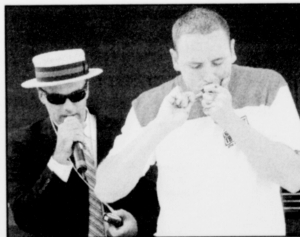
Joey Chestnut as competitor ...