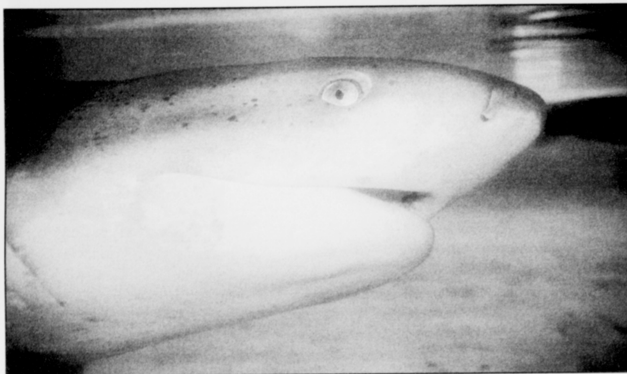
Pongo, one of the Oregon Coast Aquarium's broadnose seven gill sharks