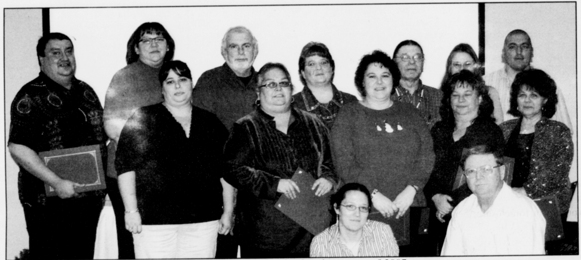
Award recipients for the fourth quarter of 2007