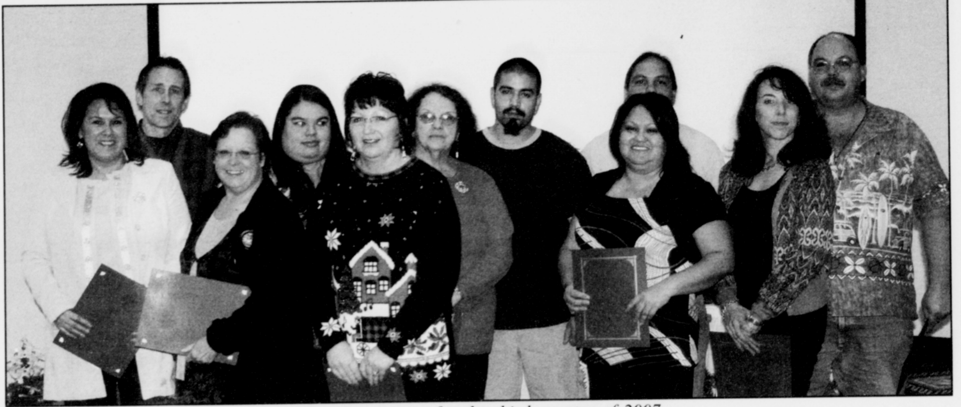
Award recipients for the third quarter of 2007