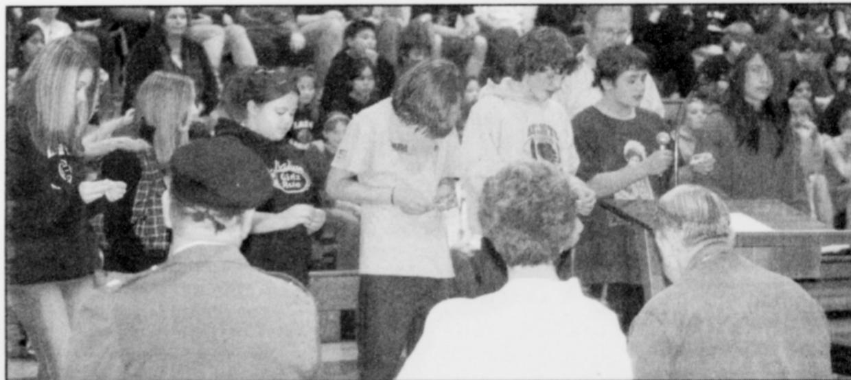
Seventh-graders read their words of thanks to the veterans.