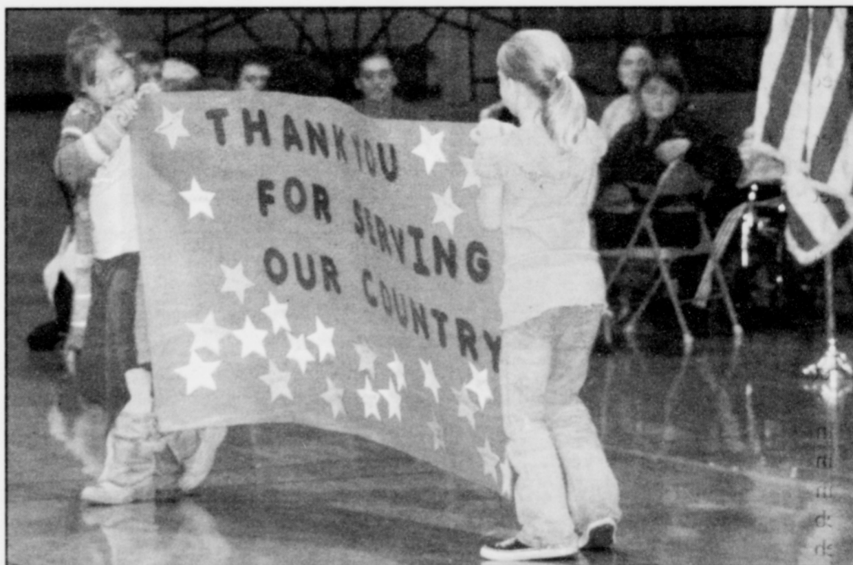
Members of the third-grade class display the class banner for the veterans.