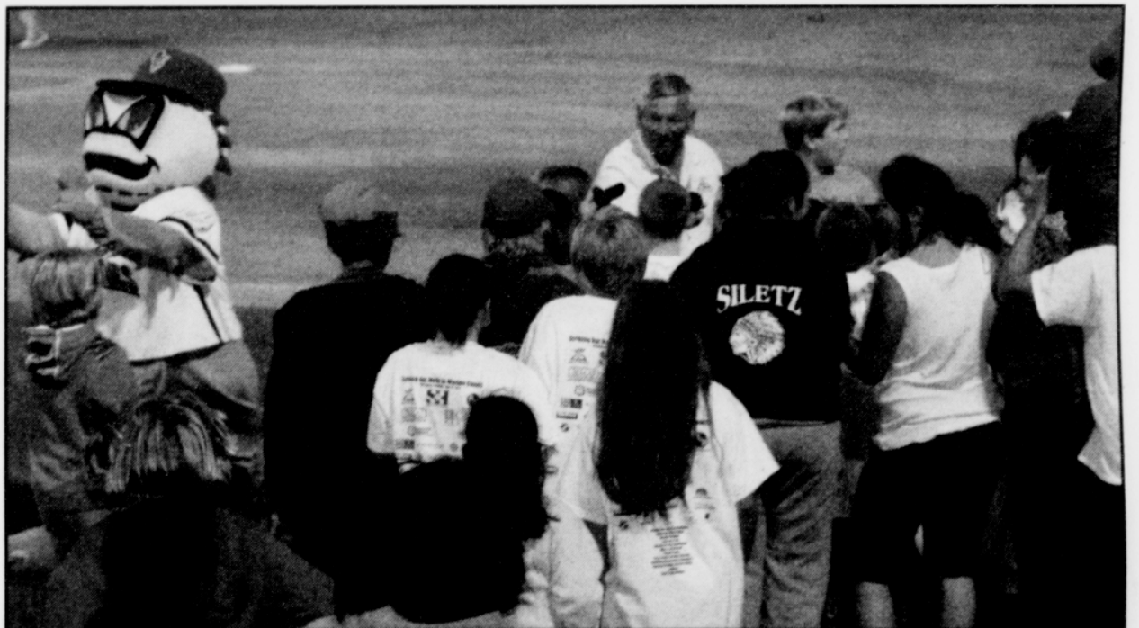
In Tune – Siletz Tribal youth join Volcanoes mascot Crater to sing "Take Me Out To The Ball Game" during the 7 th inning stretch at Volcanoes Stadium.

Again, thank you to the Confederated Tribes of Siletz Indians for helping make a child's life a little brighter. Hvm'chi