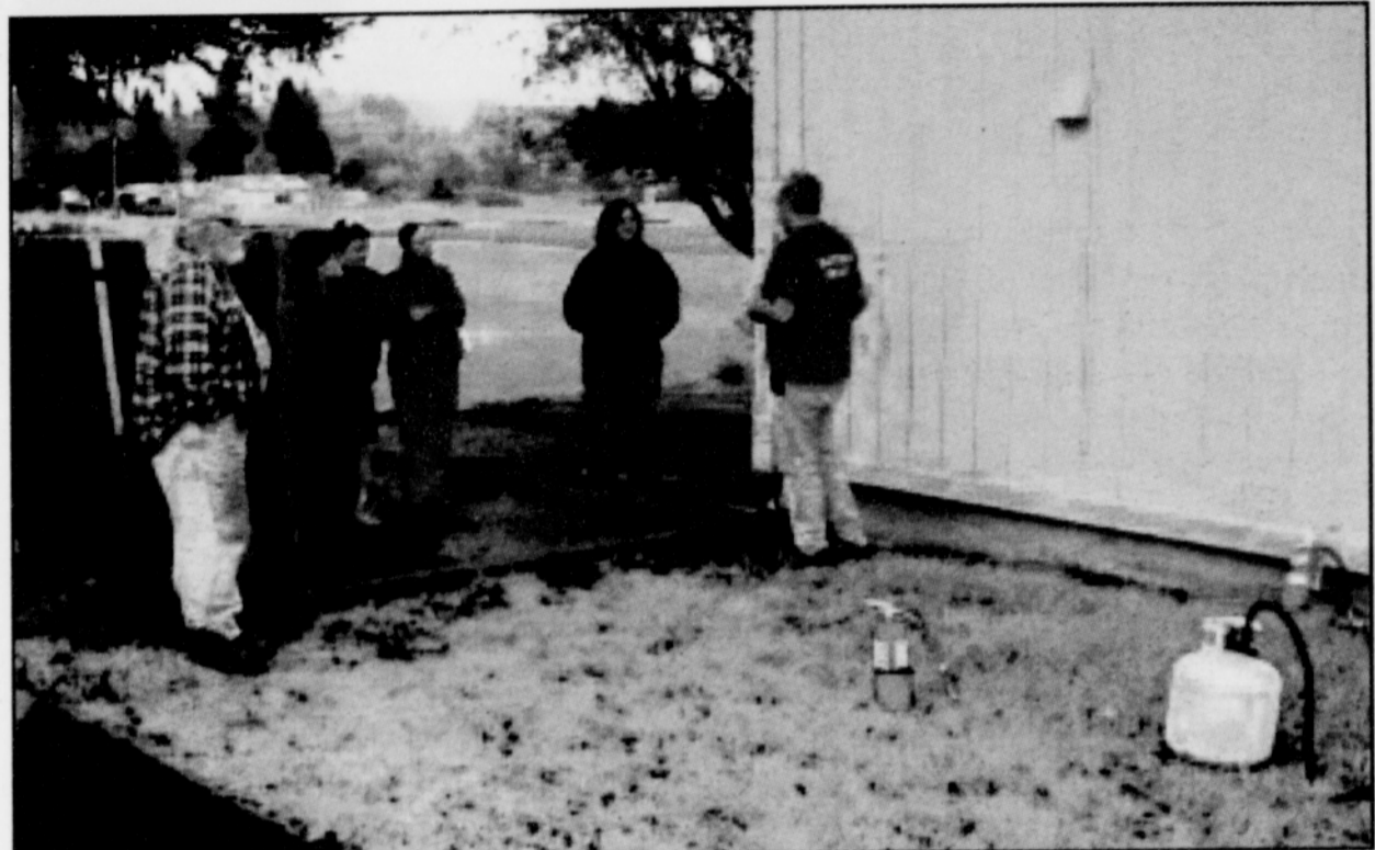
Training in fire safety comes before ...

*Tye: A Chinook Jargon word meaning "chief"