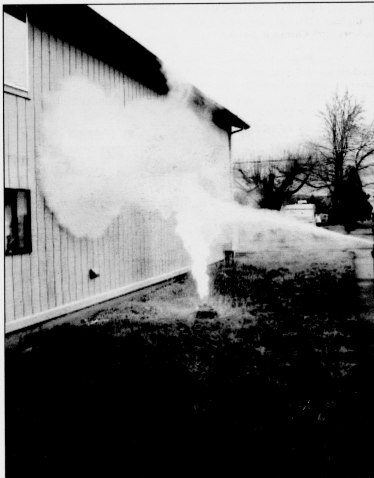
... the actual practice of putting out a fire.

Joyce Retherford, USDA FDP Clerk 541-444-8279 or 1-800-922-1399, ext. 1279