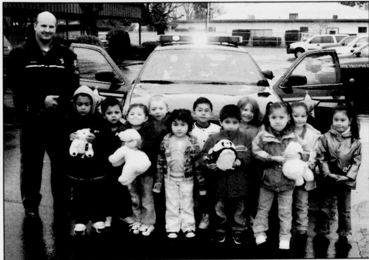
During Community Helpers Week, the Salem Area Head Start morning class visited Salem Police, who gave the children a variety of stuffed toys.