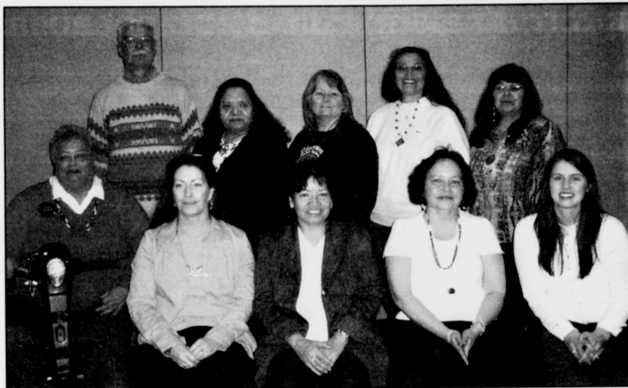
Oregon Indian Education Assoc. Board 2008

I challenge all Siletz youth, elders, and educators to attend the OIEA conference next year. This is a place where a positive image of Indigenous people should come together for our next seven generations.