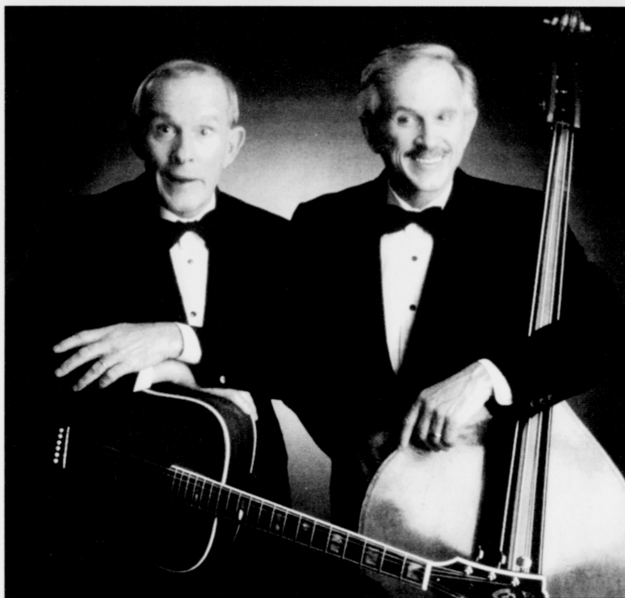
The Smothers Brothers

On the other coast, Hollywood ceremoniously distinguished them with