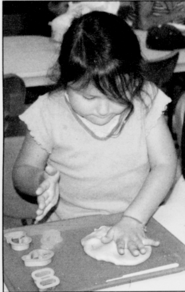
The Siletz Tribal Head Start Program provides fun activities for younger kids (above and right).