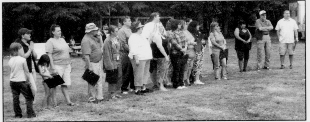
Second quarter award winners