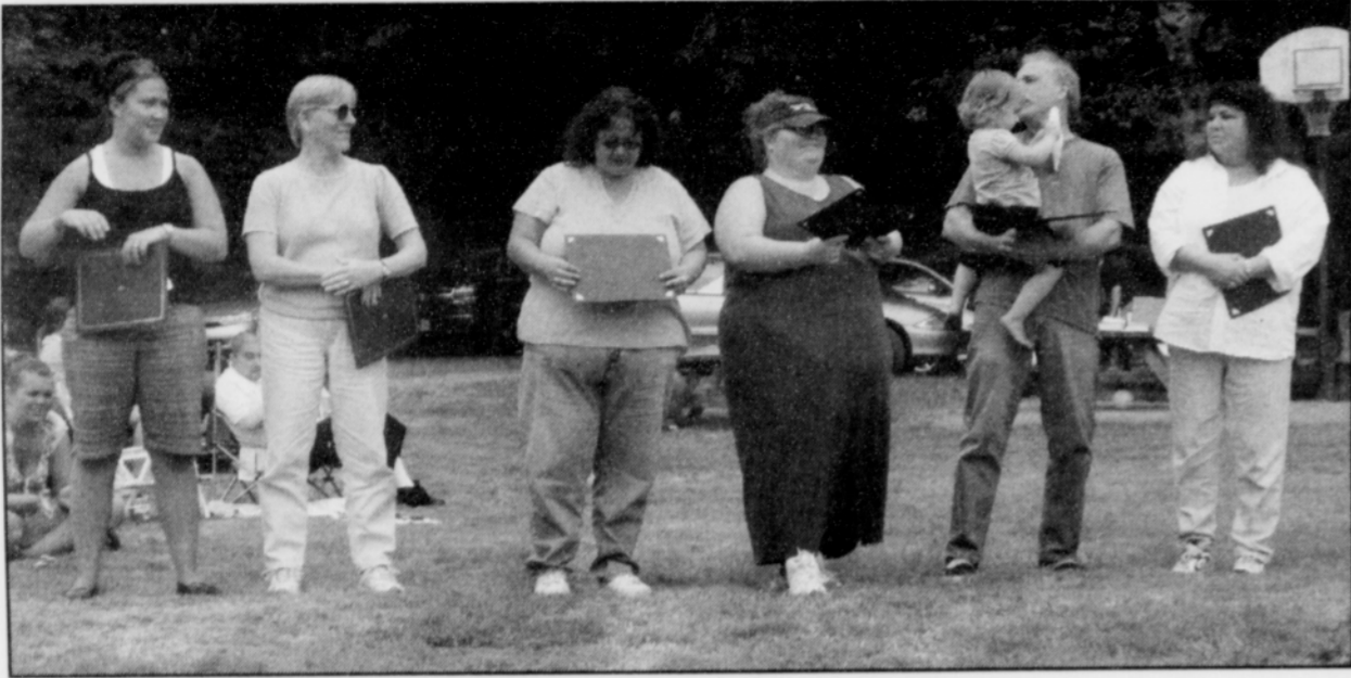
First quarter award winners