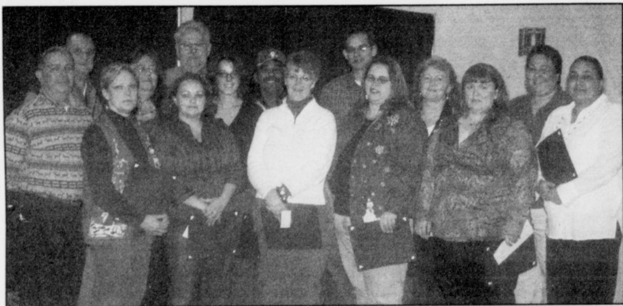
Third Quarter 2005 Incentive Award recipients