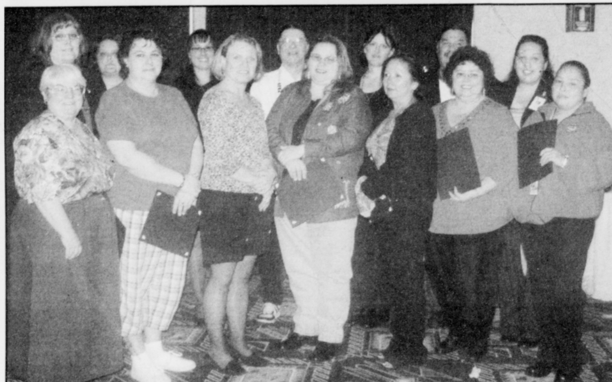
Fourth Quarter 2005 Incentive Award recipients