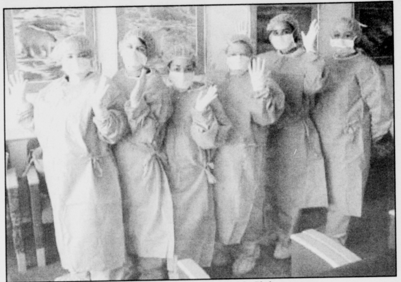
Past participants of the MY Health Club program

Hosted by ONABEN - A Native American Business Network Affiliated Tribes of Northwest Indians - Economic Development Corporation & Revolving Loan Fund Oregon Native American Chamber of Commerce