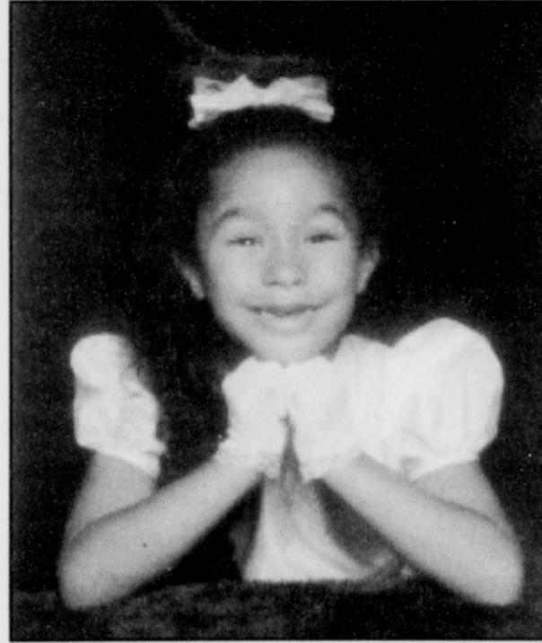
I want to wish "Gramma's Sweet-Baby-girl-lee-oo" a very, very Happy 11 th Birthday! We are soooo very proud of you! Love, Gramma and Great-Gramma too