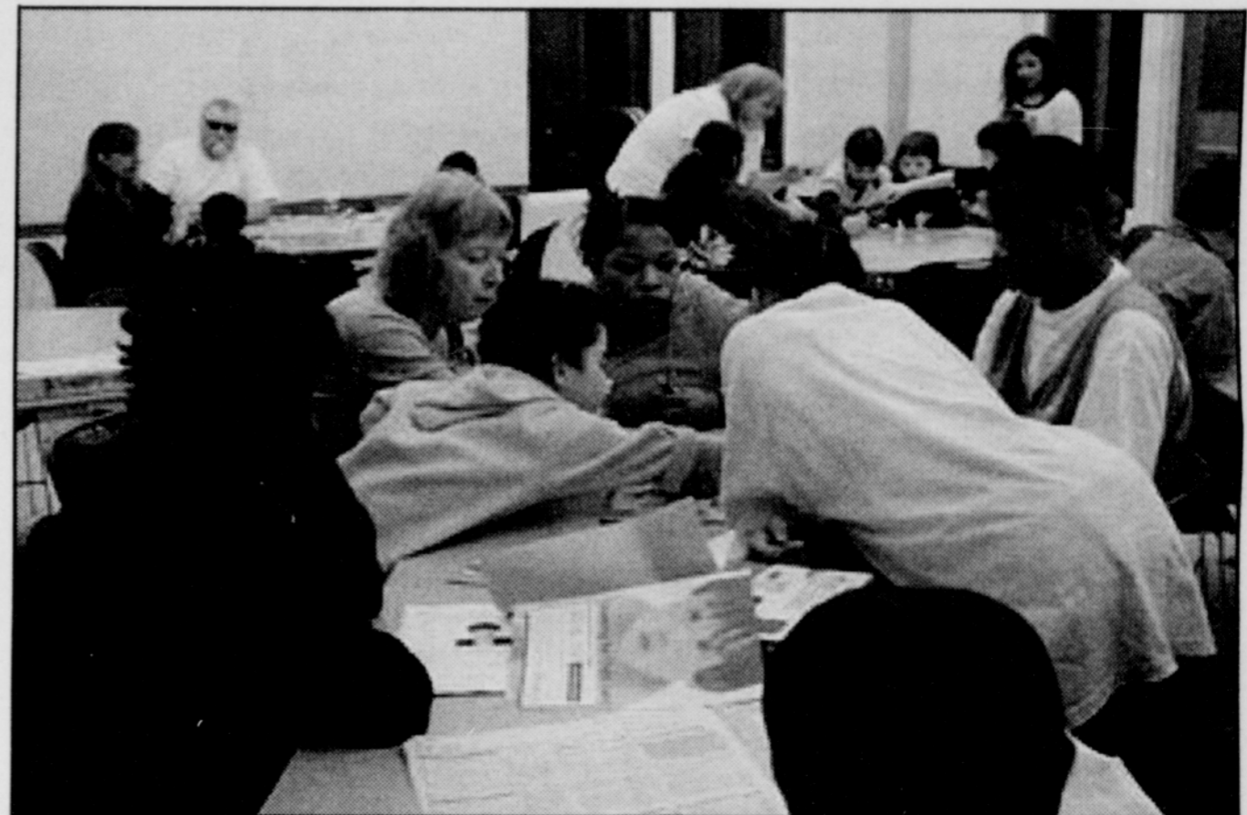
Right: Portland families and staff enjoy a family fun night of board games.