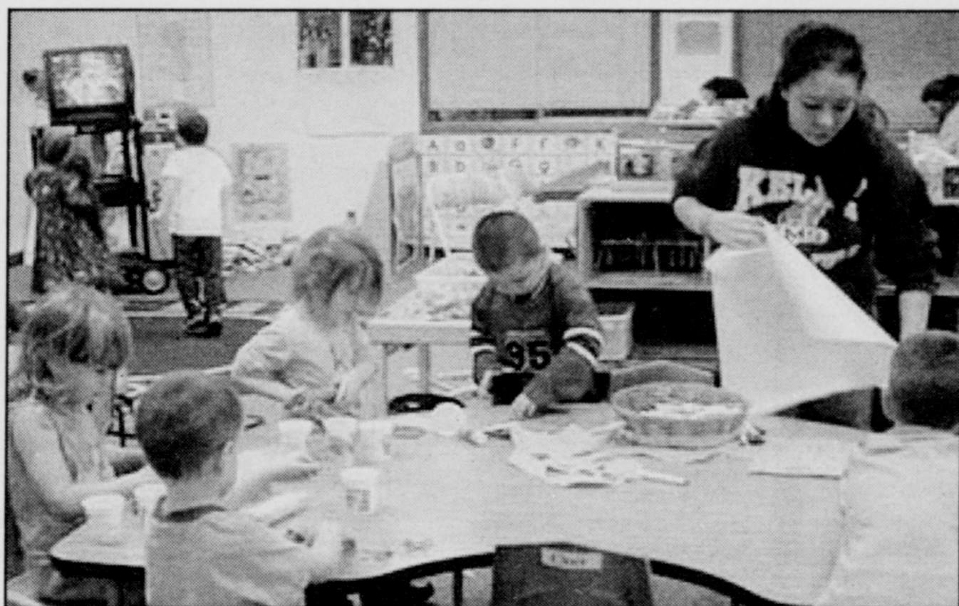
The Springfield classroom is a busy place during the parent meeting.