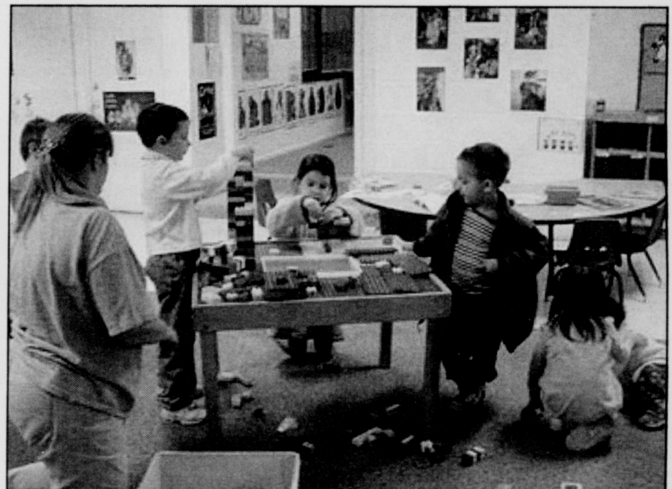
Salem kids play with blocks and other things.