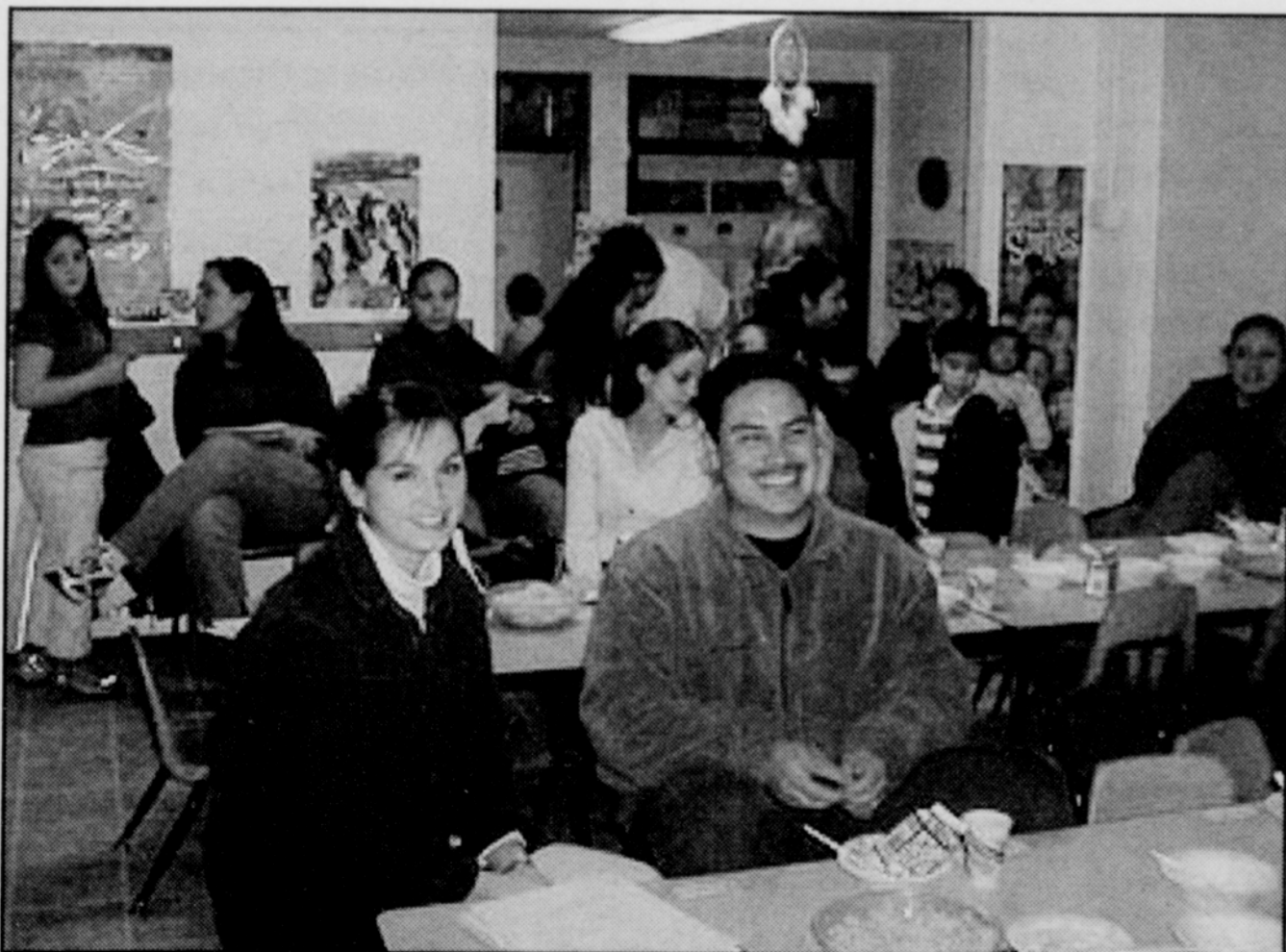
Head Start families in Salem