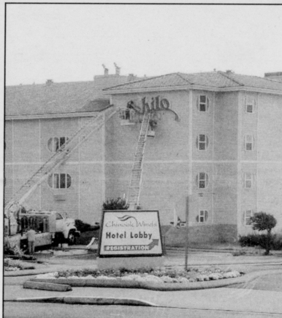
The old Shilo Inn becomes ...

“All the employees of the hotel are welcome as members of the Chinook Winds staff. I encourage each of them to explore the benefits of working with