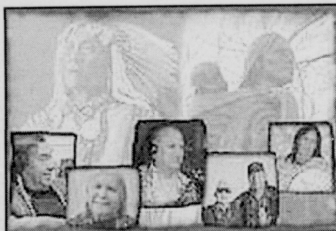
Series One CD cover