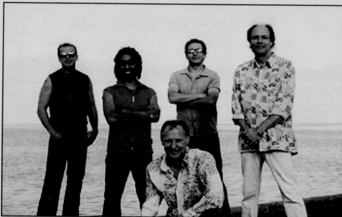
Little River Band