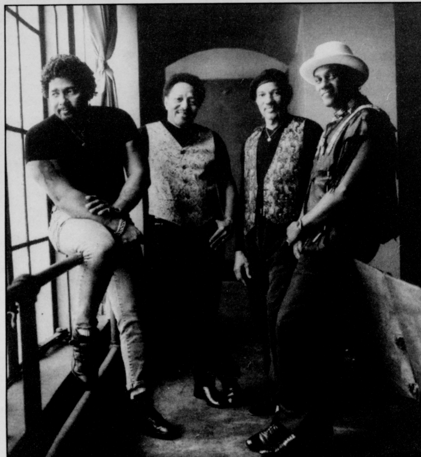
The Neville Brothers

Current members, stop by Winner's Circle for your fun book of coupons