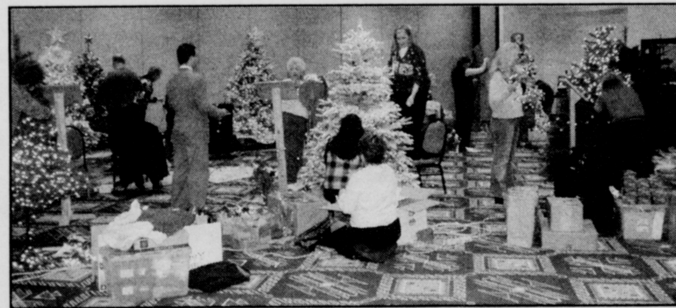
Chinook Winds employees join other Lincoln City residents and businesses in decorating trees to help raise money for Angels Anonymous.