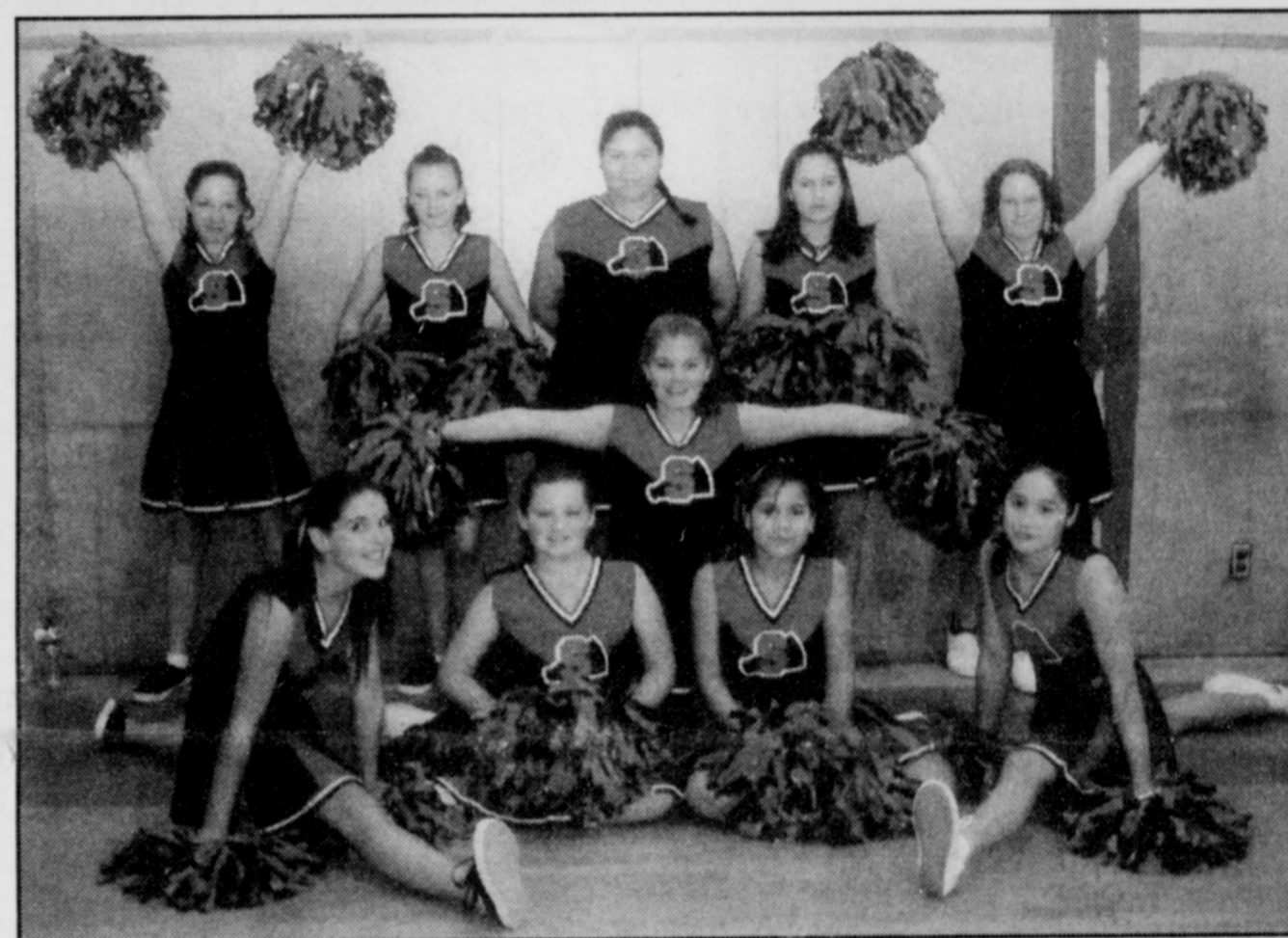
The Cheerleading Squad for Siletz Valley School

Several other employees also received awards, which are listed on page 6. Congratulations to all of you!