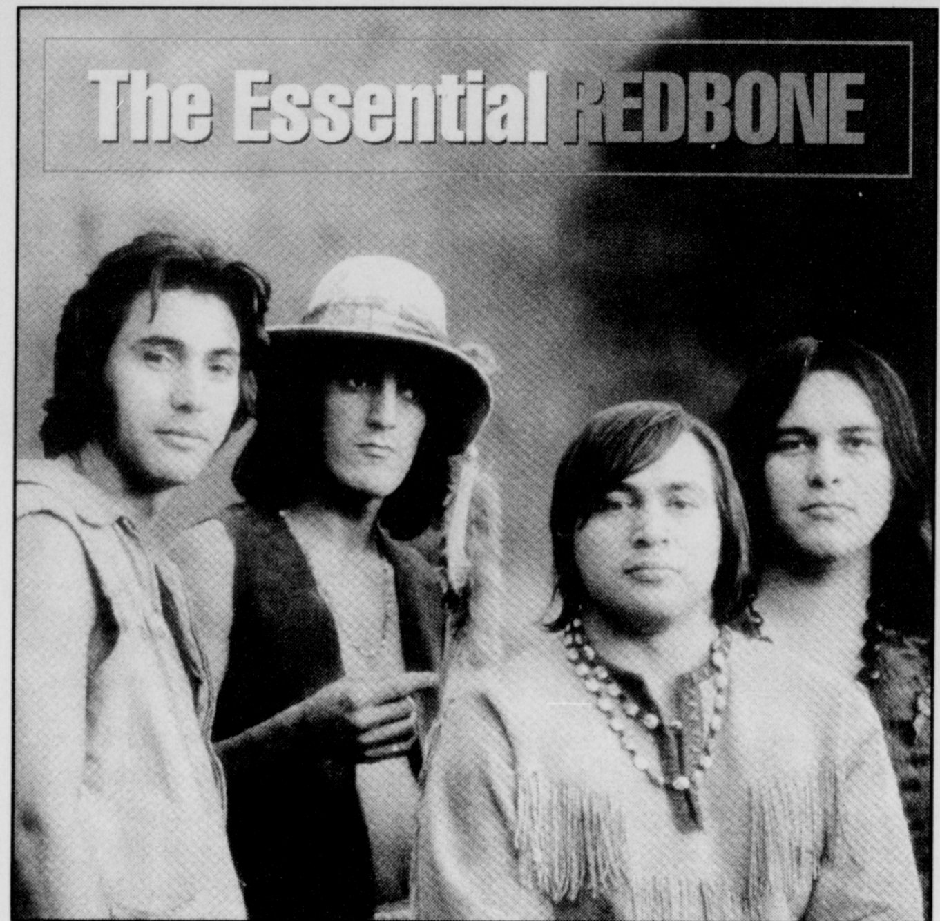
The cover of Redbone's latest CD

Pete used to play music with Jim Pepper in Portland, Ore. He and Jim