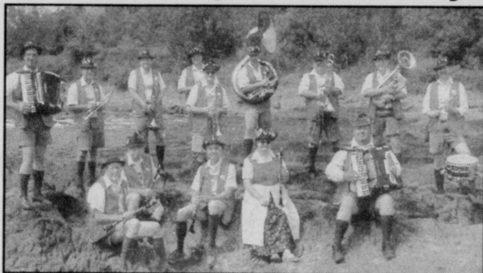
Roseburg German Band

Fans of polka and waltzes will dance their feet off to Oregon's own Roseburg German Band. This local favorite band has been entertaining for decades and is composed of talented musicians who live and work in Oregon. Members include a pediatrician, dentist, highway patrolman, music store owners, and two school