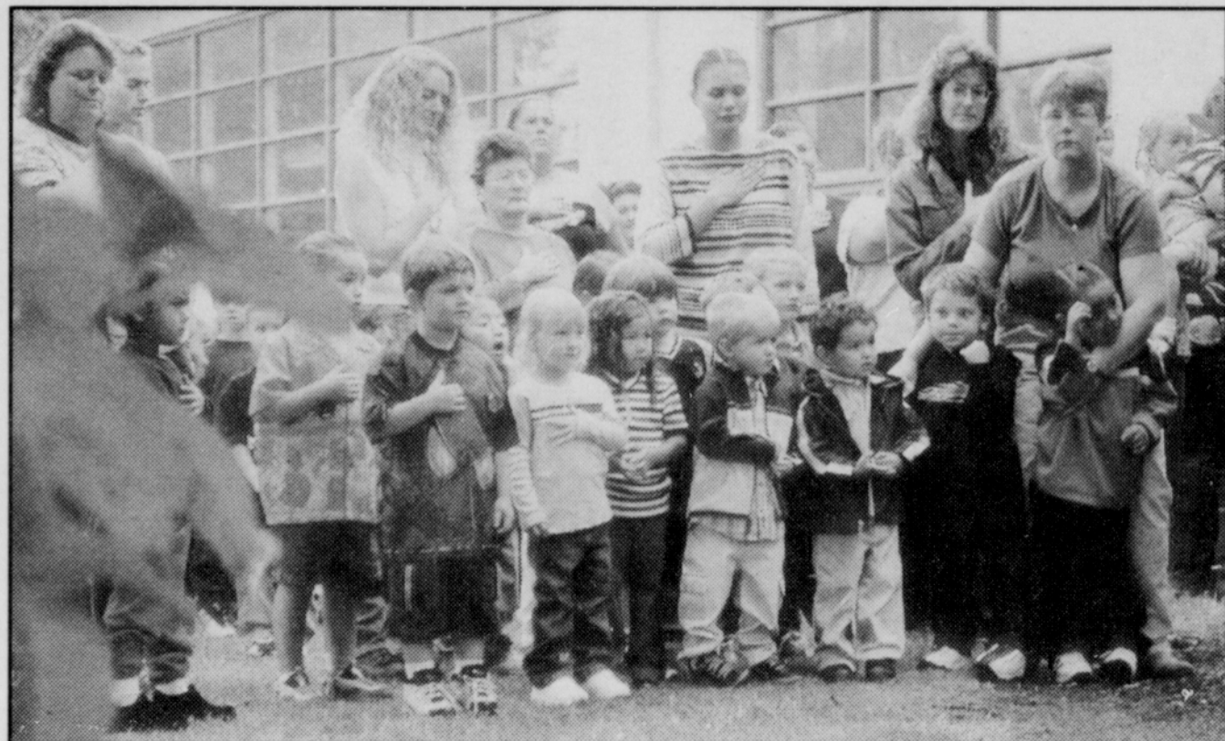
Head Start students share in the flag-raising ceremony.