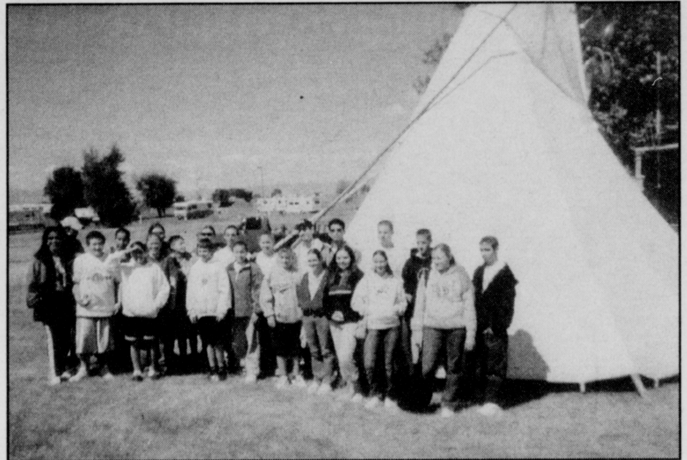
Siletz youth teams attend a leadership conference and play basketball in Washington.

Siletz Valley Partnership invites all non-profits to consider partnering with us to put next year's Third Annual Siletz Community Carnival on the map!