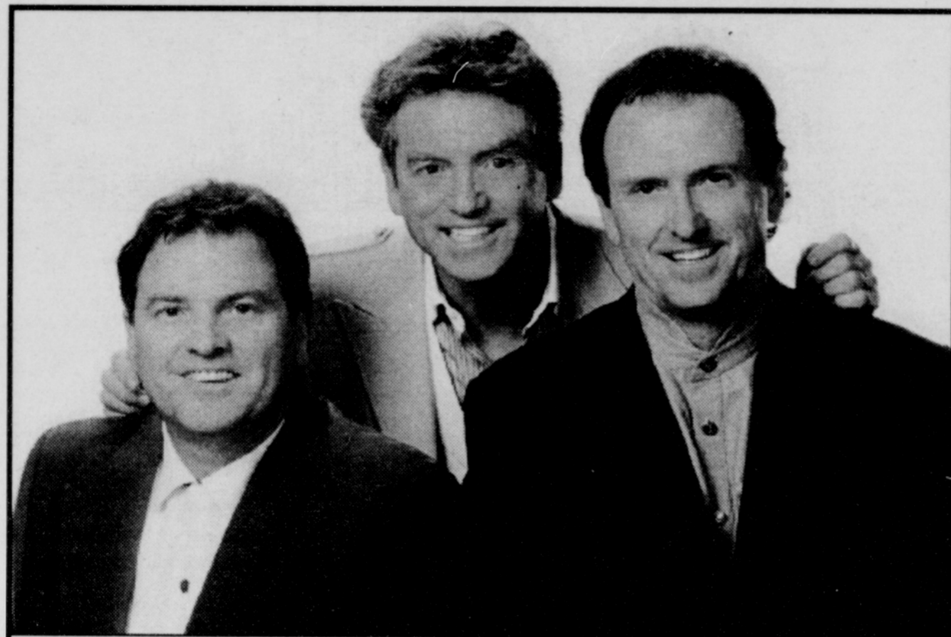
The Gatlin Brothers