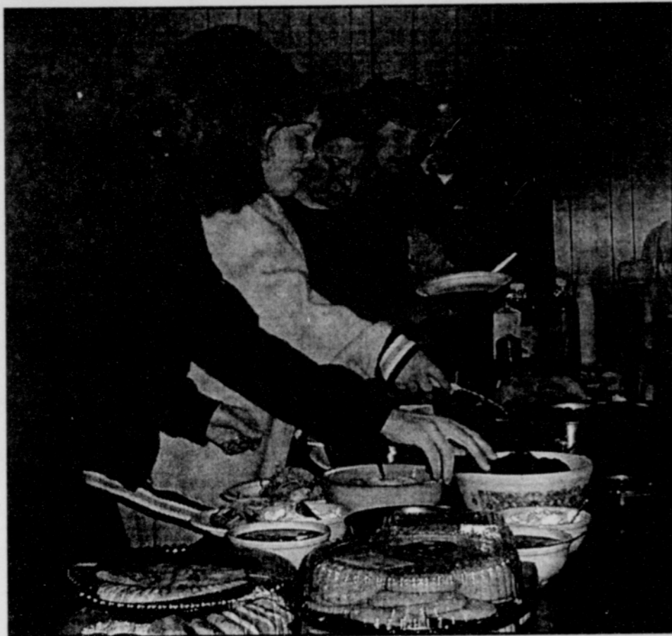
Portland Head Start families enjoy all sorts of good food.