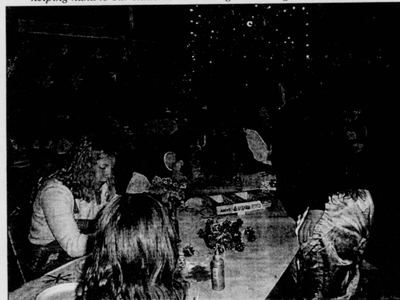
Craft night is a fun time for Head Start families and staff at the tribal center.