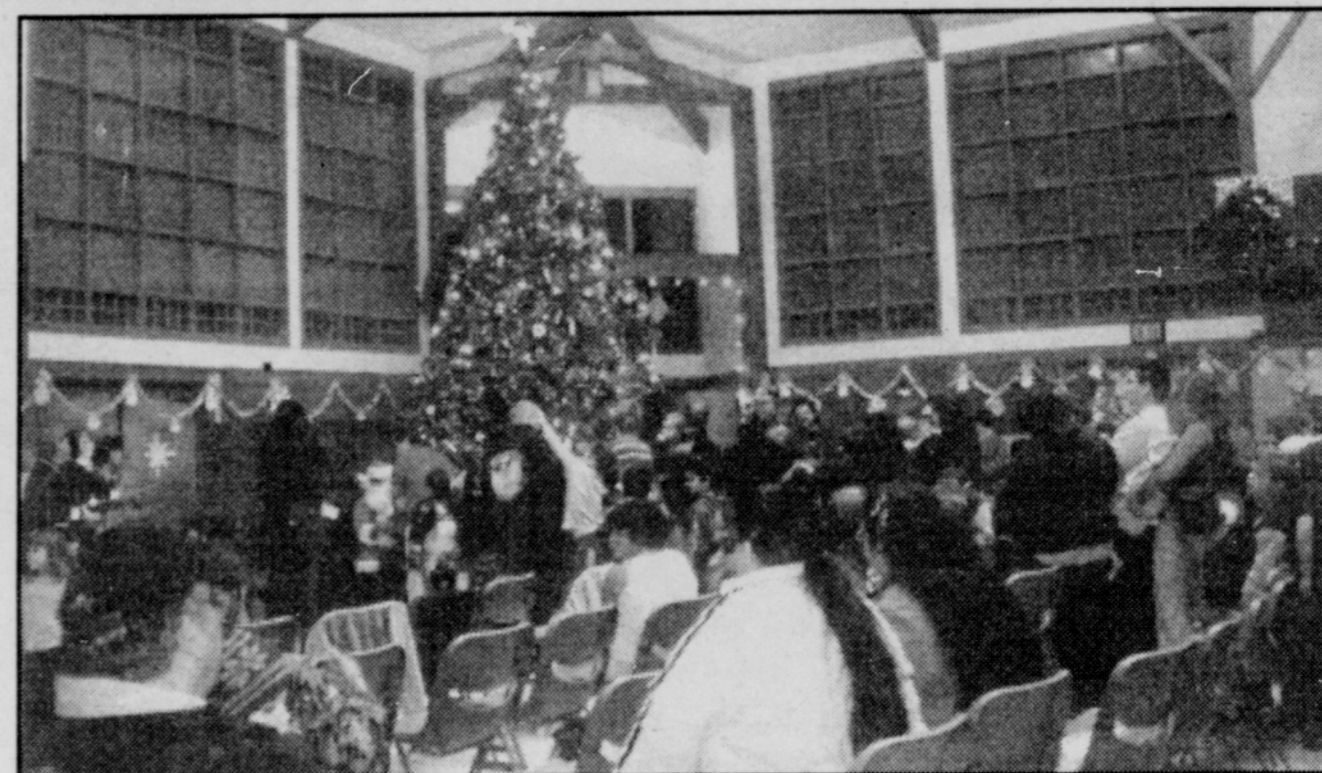
The Siletz Tribal Community Center was full of good cheer, and a lot of people, during the community Christmas celebration in mid-December.

This information also can be found at our Web site – www.itcnet.org . Mail applications to the Intertribal Timber Council, Attn: Education Committee, 1112 N.E. 21 st Ave., Portland, OR 97232-2114.