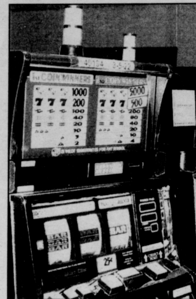
TITO machine at Chinook Winds

Additionally, I am told that we're the only Oregon casino that has TITO machines at this time.