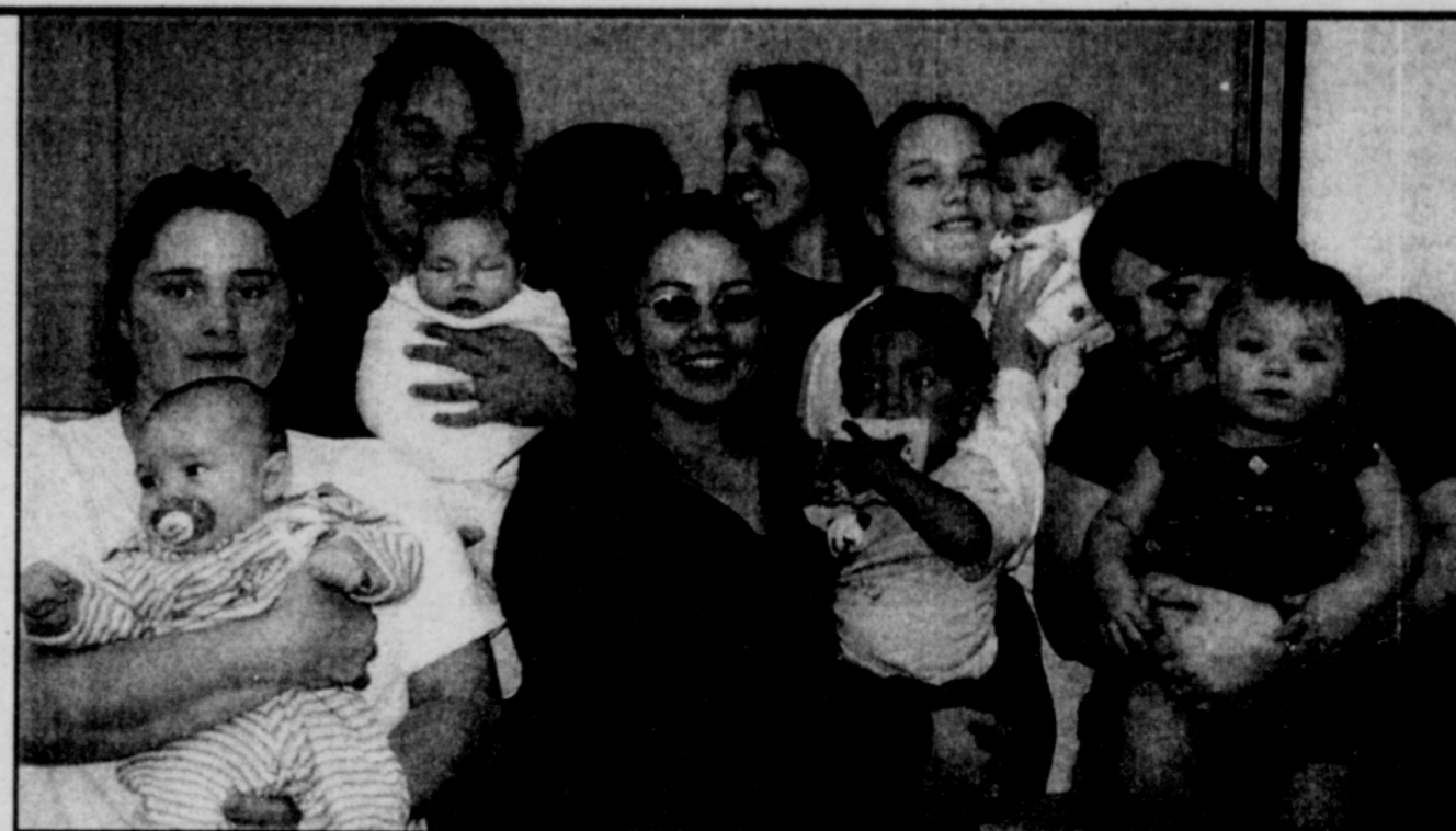
Members of the Siletz Breastfeeding Circle