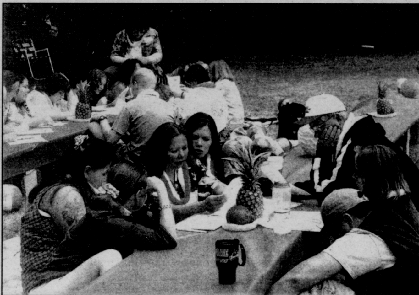
Employees participate in a group activity.