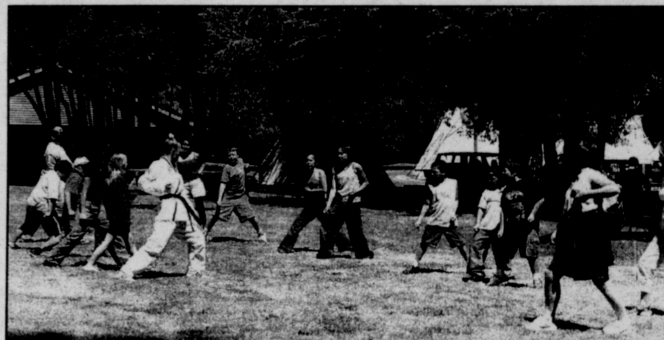
Several children took advantage of youth activities sponsored by the Tobacco Prevention and Diabetes programs. A martial arts demonstration kept them busy one afternoon, as did beach volleyball, swimming, and rock climbing on other days.