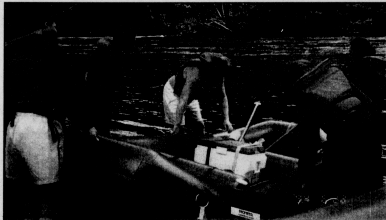
Rafters prepare to slip into the water.