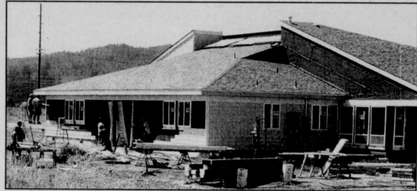
Work continues in early July.