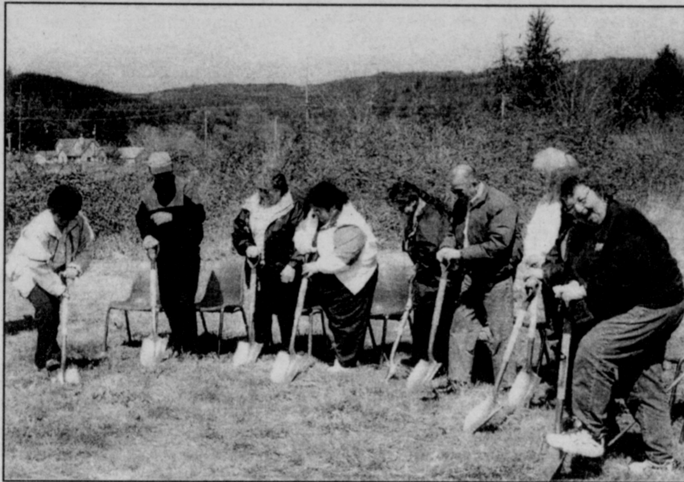
Tribal Council members "dig in" at the child care center site.