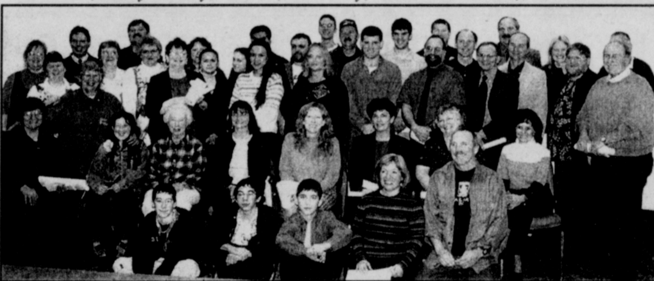
Representatives of organizations receiving charitable donations gather at Chinook Winds to receive their awards.