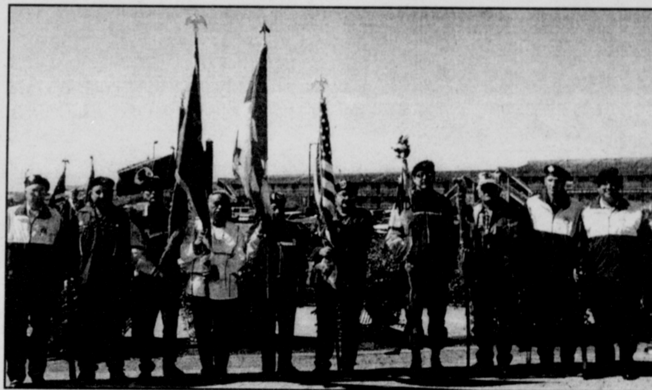
The honor guard opens the ceremony at the rededication of the Veterans Memorial.