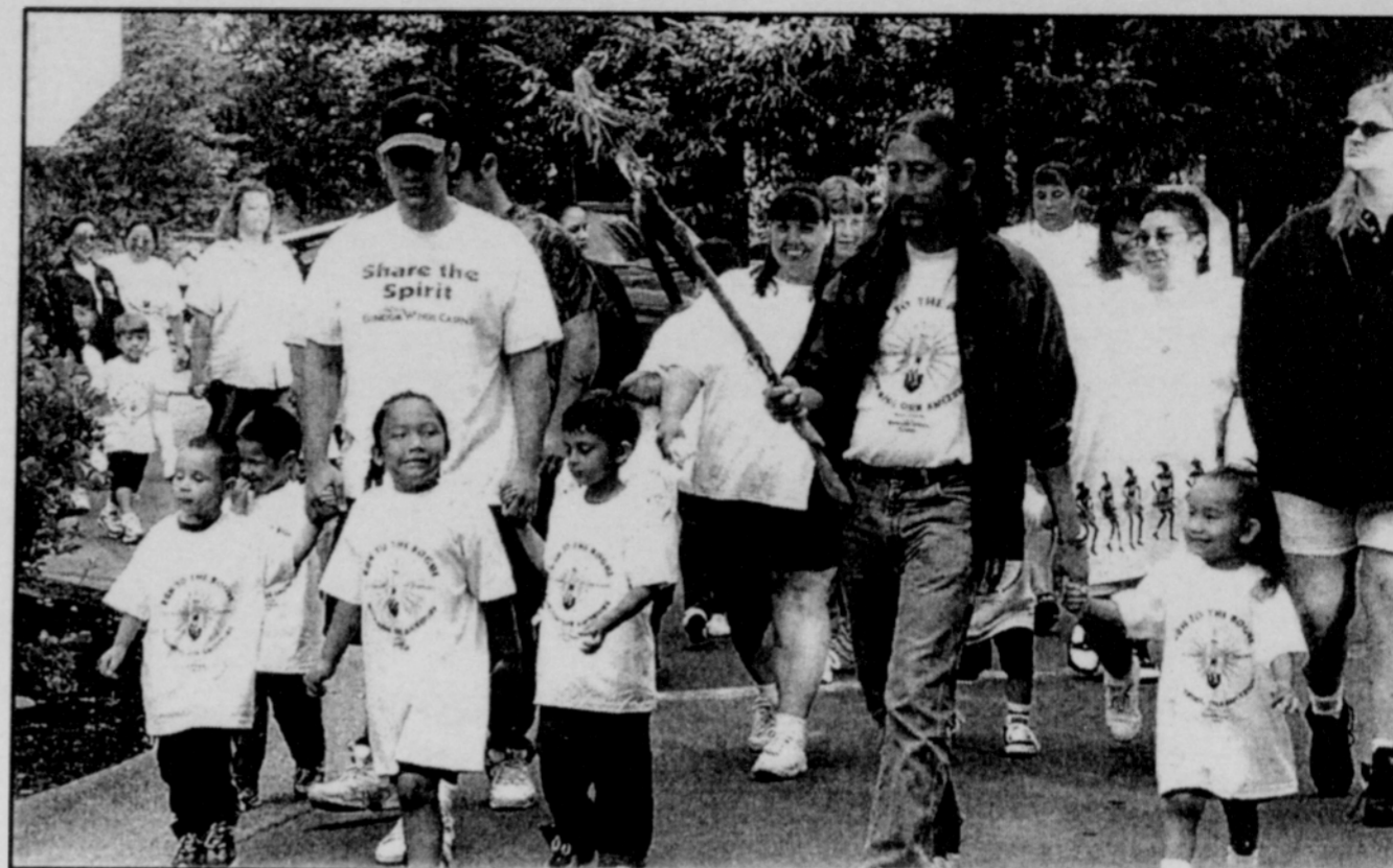
Head Start students and families start Run to the Rogue VI.

For more information or a registration packet, please call 1-800-922-1399 or 541-444-2532, ext. 290, 373, or 237. This is a wellbriety event – no alcohol or drugs.