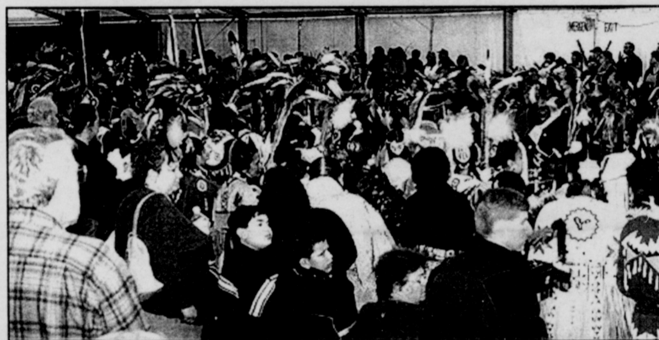
Top photo: A nearly empty tent two days before the pow-wow. Photo above: The crowd – those watching and those dancing – observes an afternoon Grand Entry.