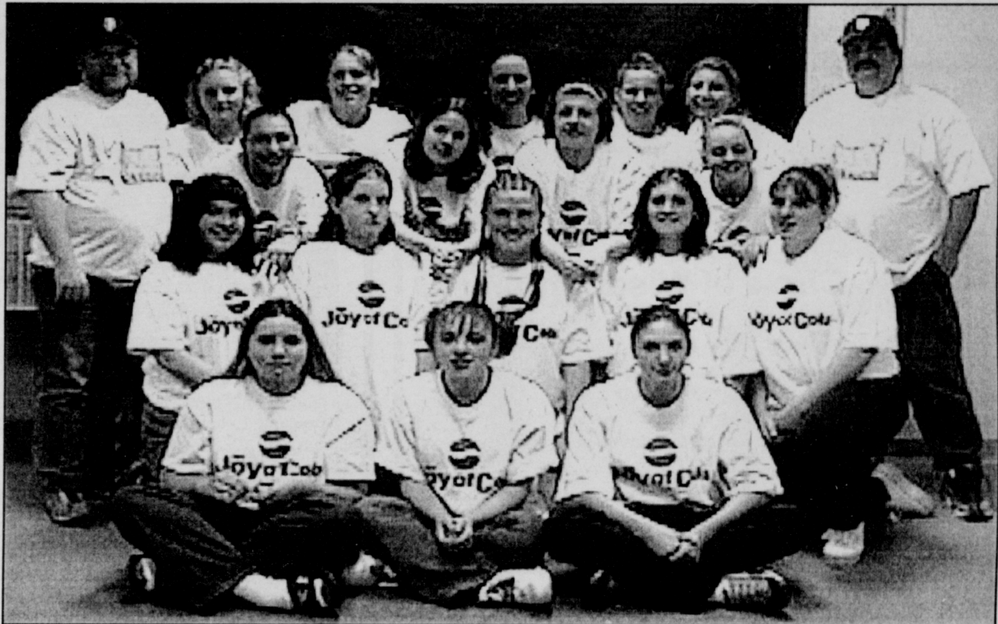
The Toledo High School Girls Softball Team ASA Hurricane Express would like to express its deep appreciation to all of you who helped make this trip to Florida possible. We had 35 fund-raisers and many tribal programs, employees, and families supported us. The team participated in a training camp and softball tournament at the Disney World Sports Center.