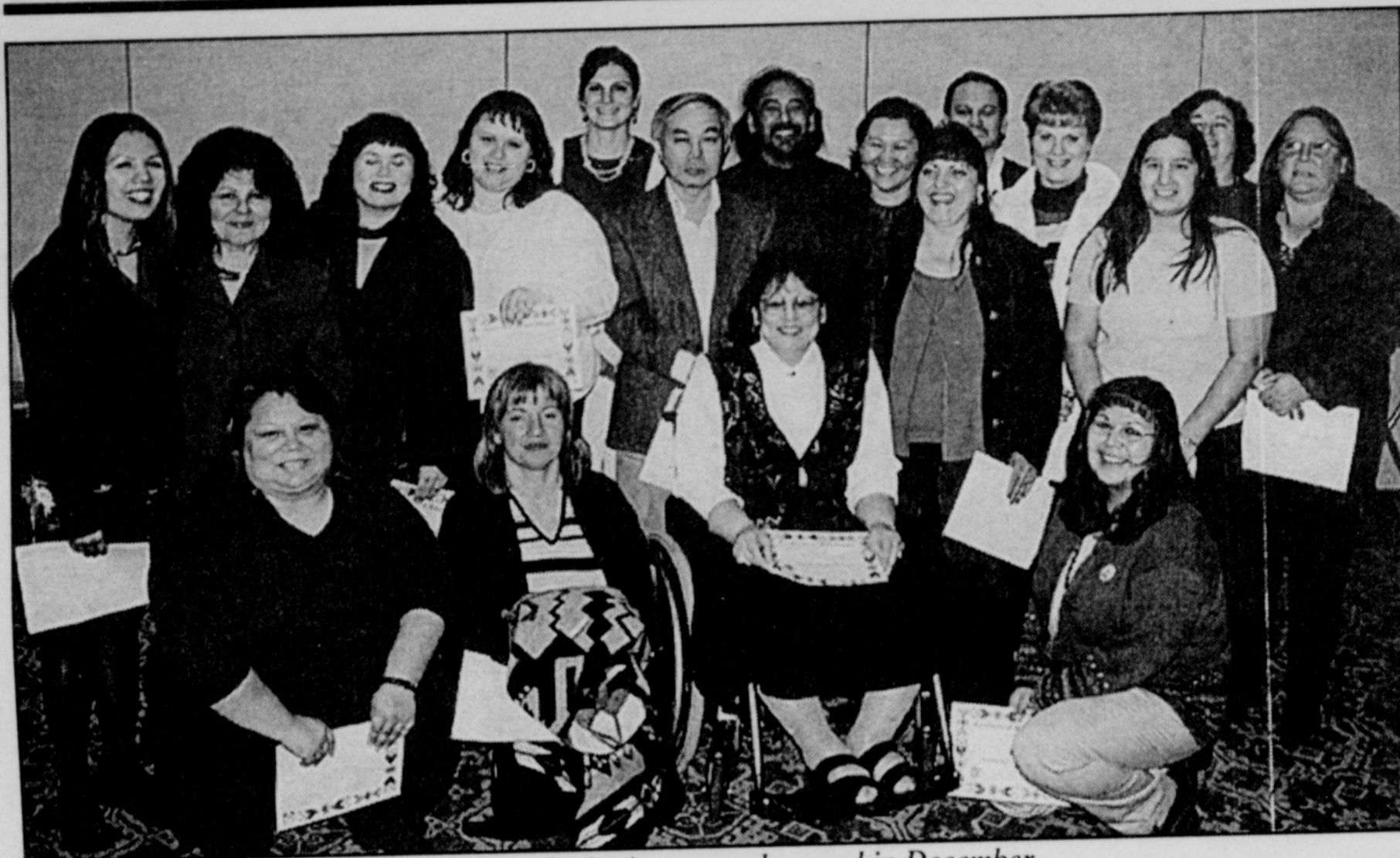
The award-winning group honored in December