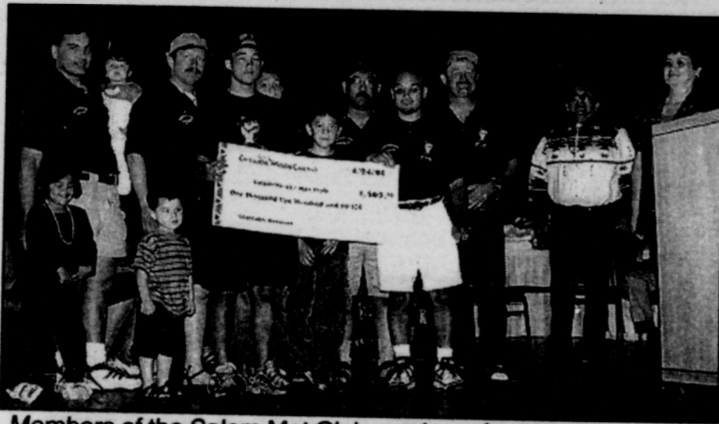
Members of the Salem Mat Club receive a $1,500 donation from the Siletz Tribal Charitable Ad-Hoc Committee.